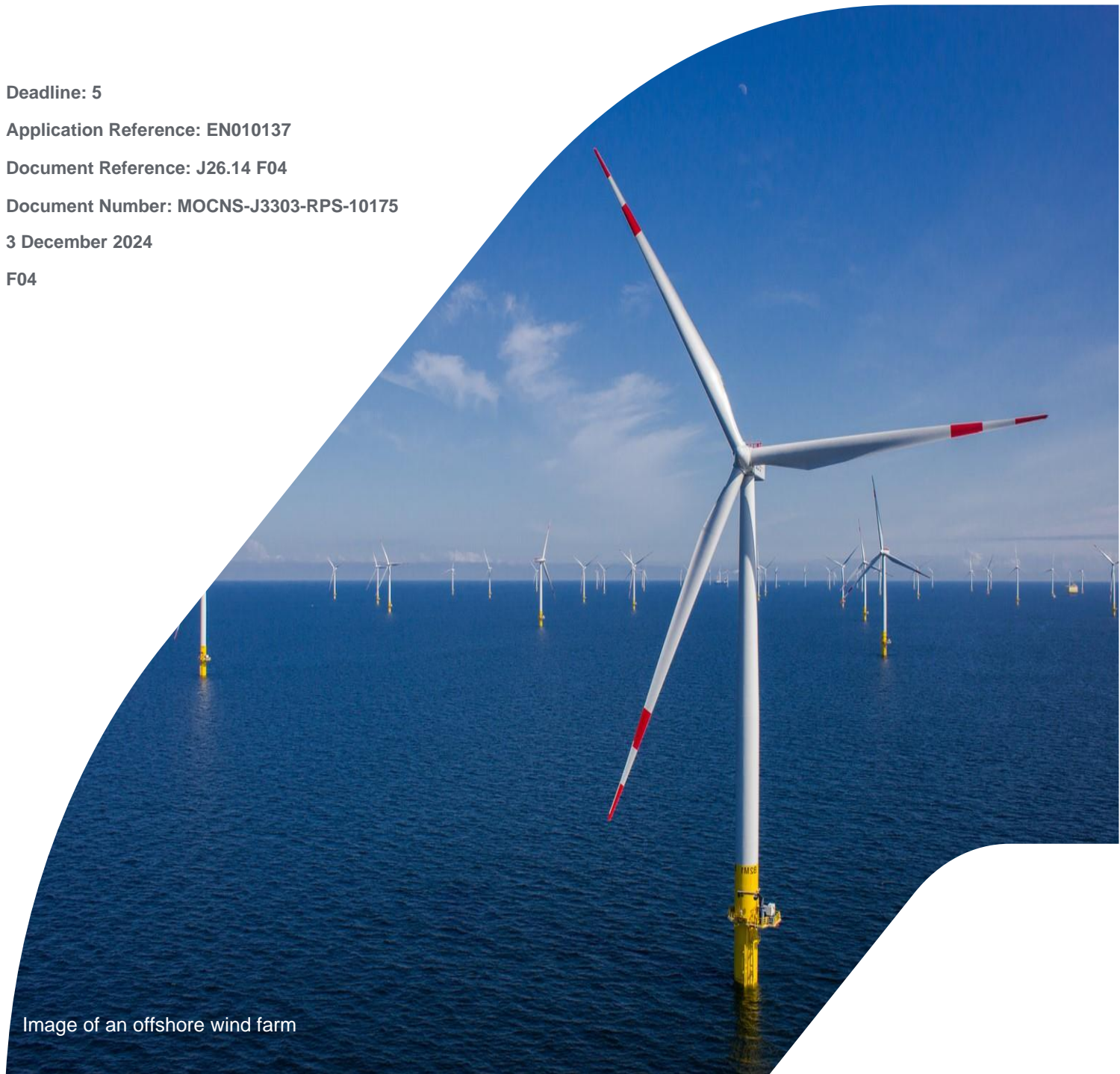
Image of an offshore wind farm